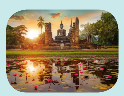
Ayutthaya Ancient Temples