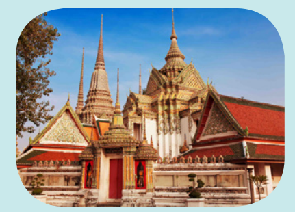
Wat Phra Chetupon