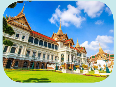
Grand Palace Bangkok