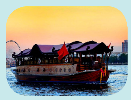
Manohra Luxurious Dinner Cruise