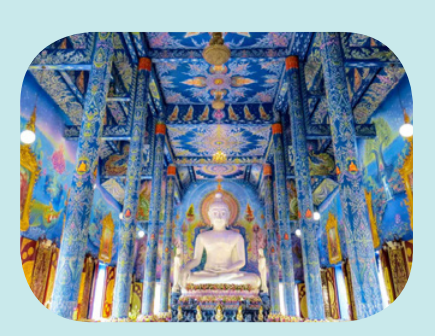
Wat Rong Khun