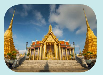
Wat Phra Kaew