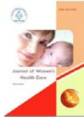
Journal of Women's Health Care