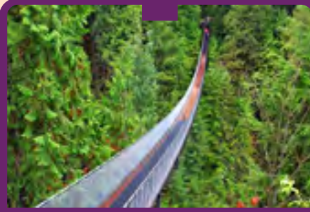
Capilano Suspension Bridge