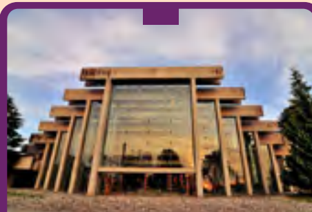
Museum of Anthropology