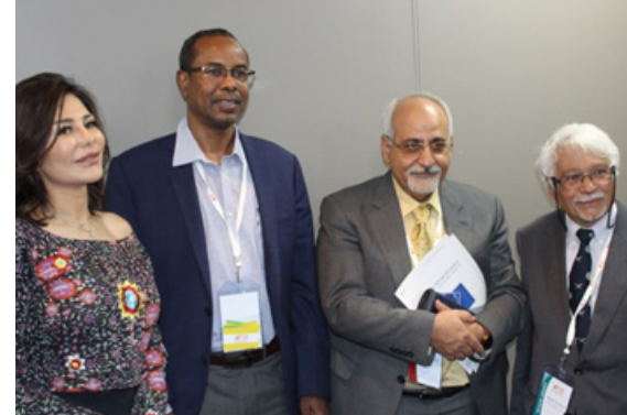
June 08-10, 2020 Barcelona | Spain