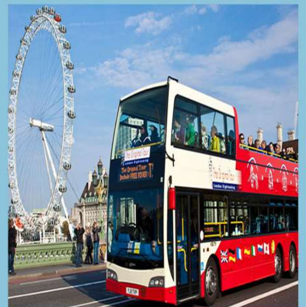
Hop on hop off bus tour