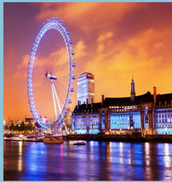
Coca-Cola London Eye