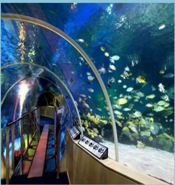
SEA LIFE London