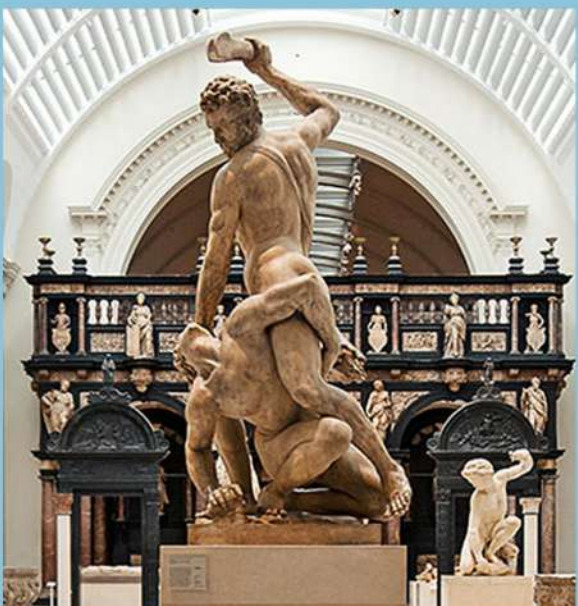
Victoria and Albert Museum