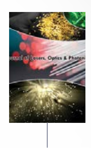
Journal of Lasers Optics Photonics

International Journal of Ophthalmic Pathology