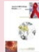
Journal of AIDS & Clinical Research ISSN: 2155-6113 | Volume 14