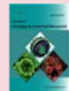
Journal of Virology & Antiviral Research ISSN: 2324-8955 | Volume 12