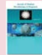
Medical Microbiology & Diagnosis ISSN: 2161-0703 | Volume 12