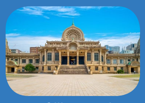
Tsukiji Hongan Ji