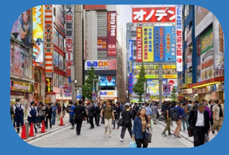
Akihabara Electric Town