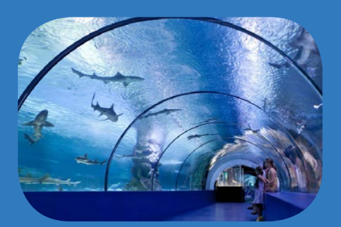
Osaka Aquarium Kaiyukan