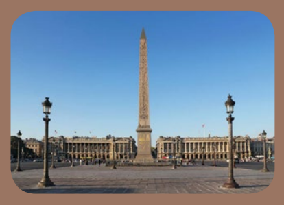
place de la concorde