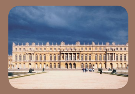
palace of versailles