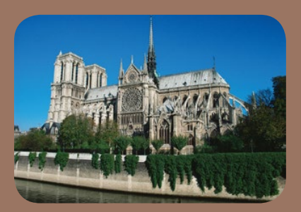
Notre Dame Cathedral