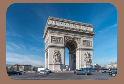
Arc of Triumph