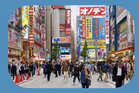
Akihabara Electric Town