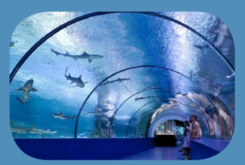
Osaka Aquarium Kaiyukan