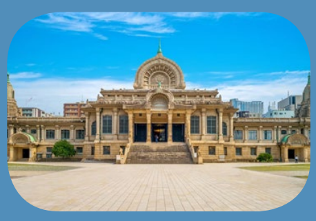
Tsukiji Hongan Ji