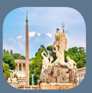
Santa Maria del Popolo