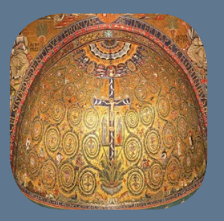
Church of San Clemente