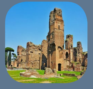
Baths of Caracalla