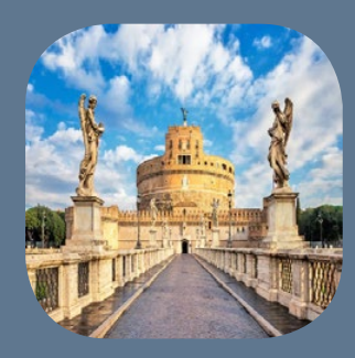
Castel Sant'Angelo National Museum