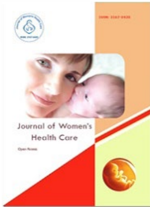
Journal of Womens Health Care