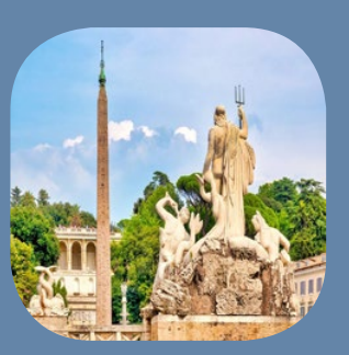
Santa Maria del Popolo