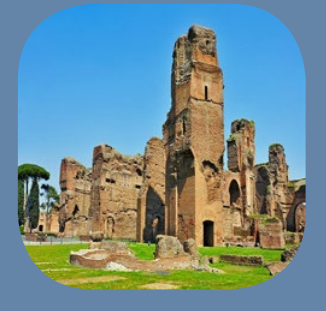
Baths of Caracalla