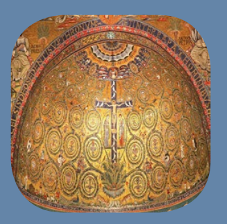
Church of San Clemente