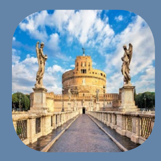
Castel Sant'Angelo National Museum