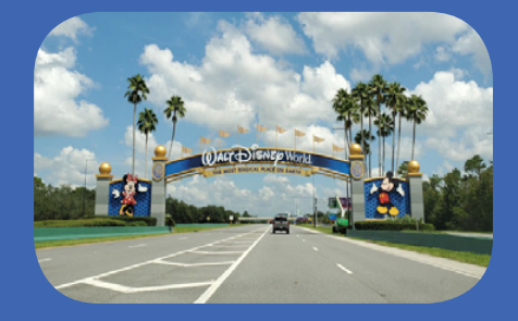
Walt Disney World

https://dermatology.averconferences.com/venue.php