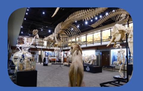
Skeletons Museum of Osteology