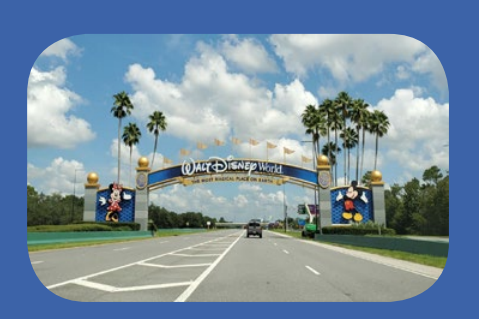
Walt Disney World