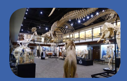
Skeletons Museum of Osteology