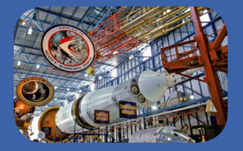
Kennedy Space Center