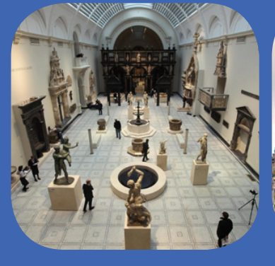
Victoria and Albert Museum