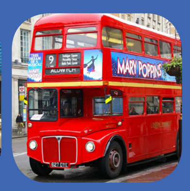
Hop on hop off bus tour