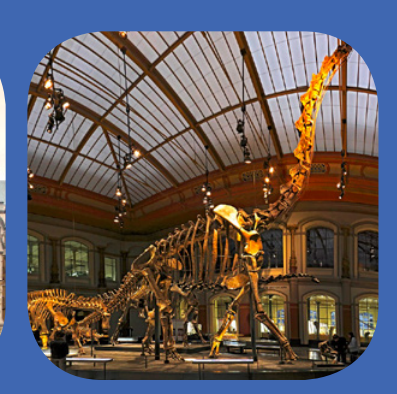
Natural History Museum