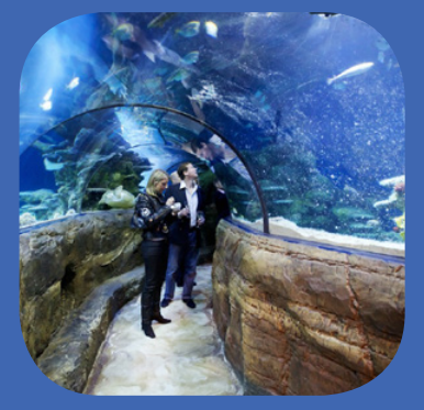
SEA LIFE London