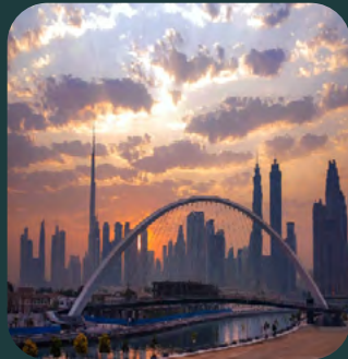
Dubai Water Canal