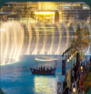
The Dubai Fountain