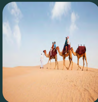
The Dubai desert