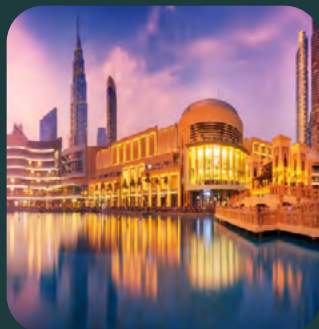
The Dubai Mall