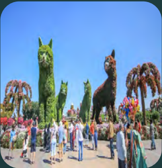
Dubai Miracle Garden