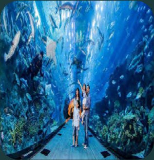
Aquarium and Underwater Zoo