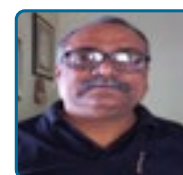
Subhas Chandra Datta Kanchannagar D N Das High School, India