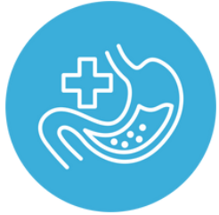
Innovations in Gastroenterology

At Gastroenterology & Hepatology 2026 , education goes beyond traditional lectures. Our sessions are designed to be immersive, interactive, and impactful , ensuring every participant leaves with new skills, fresh perspectives, and practical knowledge .