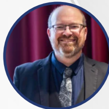
Brad McEwen Health Institute, Australia